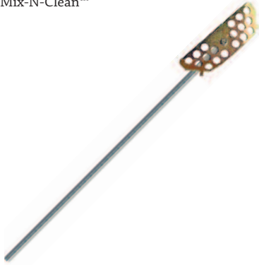
Model 1521 Mix-N-Clean™